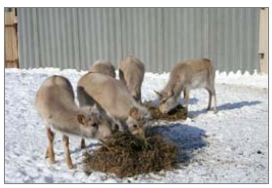
The feeding of young saigas.

The animals were monitored daily after release. When the cold season came the animals moulted and judging by their appearance gained weight. On 13 November an adult male was brought from Kalmykia for the rut. He was released into an enclosure with three females. On 27 December, the male ceased to show any interest in the females. On 12th-15th January, keepers observed signs of heat in the injured female, Jadi, who had recovered from her fractured leg. On 12 January, during the morning feed, she was excited and making loud noises, to which the adult male responded. Young males, separated by a corrugated iron wall, were also excited and making noises. Jadi tried to break out of her enclosure through a slightly opened door, a behaviour that had previously not been noted. In January, the young males started to play-fight, although the lame male was in worse condition than the others. All three females became pregnant. The first calf was born about 6 pm on 17 May, and within 1.5 hours was standing and bleating. The second calf was born on 19th May, and Jadi gave birth to a calf on 14th June.