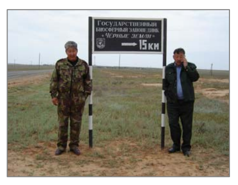
On the border of nature reserve.