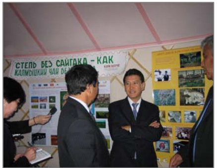
The Head of Kalmykia discussing saiga conservation with the Director of the Centre for Wild Animals.

The development of the Visitor Centre will continue, with the aim that it will act as a hub for environmental education and action for Kalmykia. Many international organisations have supported it financially, including the UK government's Darwin Initiative and SEPS, Large Herbivore Foundation, US Fish and Wildlife Service, Denver Zoo, Foundation Zoos Help, Colorado Zoo, ITERA, TNT-Express."