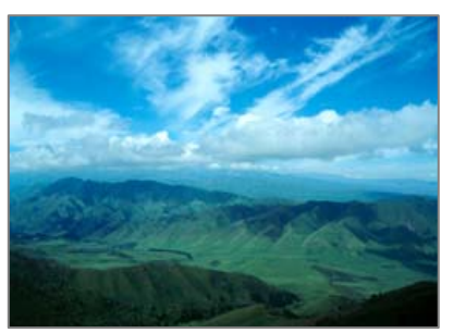
Xia'erxili nature reserve.

The Xia'erxili Nature Reserve (hereafter Xia'erxili NR) is located at E81°43'-82°33', N45°07'- 45°23' along the northern slope of Alataw Mountain in the Mongolian Autonomous Prefecture of Bortala, Xinjiang Autonomous Region, China. The northern border is adjacent to Kazakhstan._The biodiversity in this region has been effectively conserved because there has not been any disturbance from human activities in a long time. This pristine condition is quite rare in Central Asian and Mongolian transition regions.